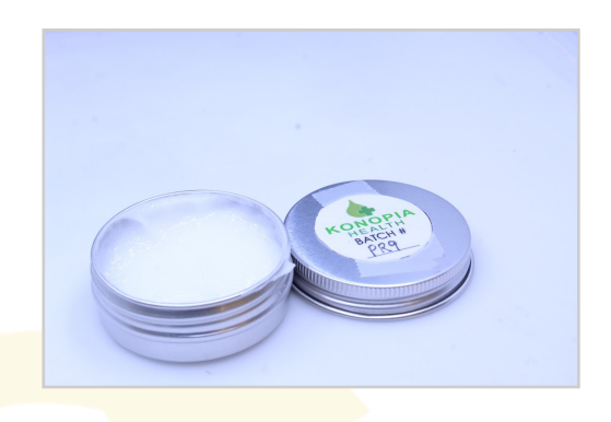
Unit: 1mL |Units Per Package:1