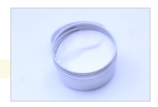
Unit: 1mL (1g) | Units Per Package:1

Analyzed via AAM-001 using Agilent 1220 HPLC-DAD. Limits are based on CO 1 CCR 212-3. Sample was analyzed as received. Deviations from SOP: None.