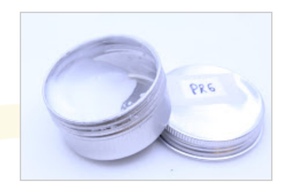
Unit: 1mL (0.95g) | Units Per Package:1

Analyzed via AAM-001 using Agilent 1220 HPLC-DAD. Limits are based on CO 6 CCR 1010-21. Sample was analyzed as received. Deviations from SOP: None.