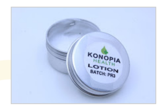
Unit: 1 mL (0.97g) | Units Per Package:1

Analyzed via AAM-001 using Agilent 1220 HPLC-DAD. Sample was analyzed as received. Deviations from SOP: None